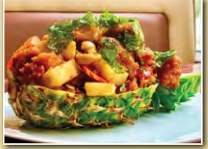
#45 Pineapple Chicken

Served to your table on a sizzling plate, our large deep fried scallops are sautéed in our chef's special blend of sauces and veggies, topped with fried basil and