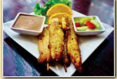
#2 Chicken Satay

Green leaf, carrot, bean sprouts, basil, shrimp, and rice noodles wrapped in soft rice paper. Served with peanut sauce.