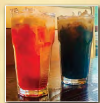
Thai Iced Tea, Thai Iced Coffee