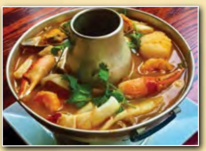
#12 Tom Yum Seafood

A moderately spicy soup with lemon grass, mushroom, tomatoes, green onion, chili paste, cilantro, lime leaves, and sweet basil. Served in a hot pot.